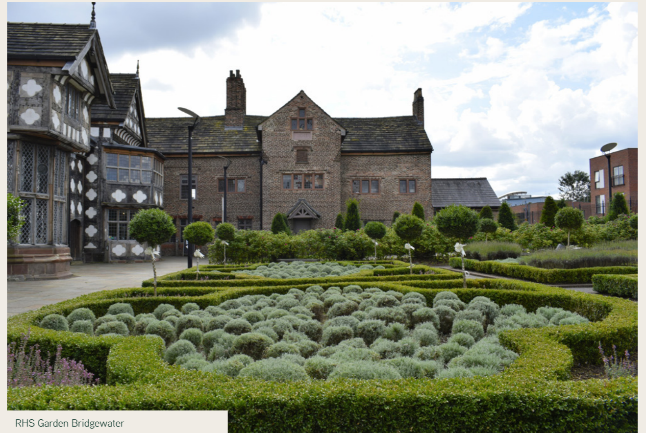
RHS Garden Bridgewater

It's not all hustle and bustle, though. Monmouth Park, Ordsall Hall and RHS Bridgewater have beautiful grounds and are both free of charge to visit; take a break from the city and enjoy a walk with family and friends.