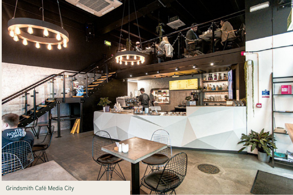
Grindsmith Café Media City