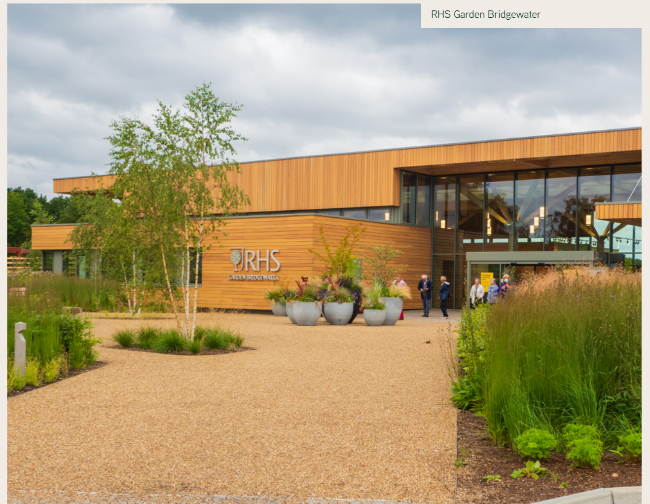
RHS Garden Bridgewater