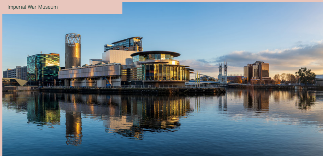
Imperial War Museum

The BBC employs over 4,000 people in Salford with further plans for expansion".