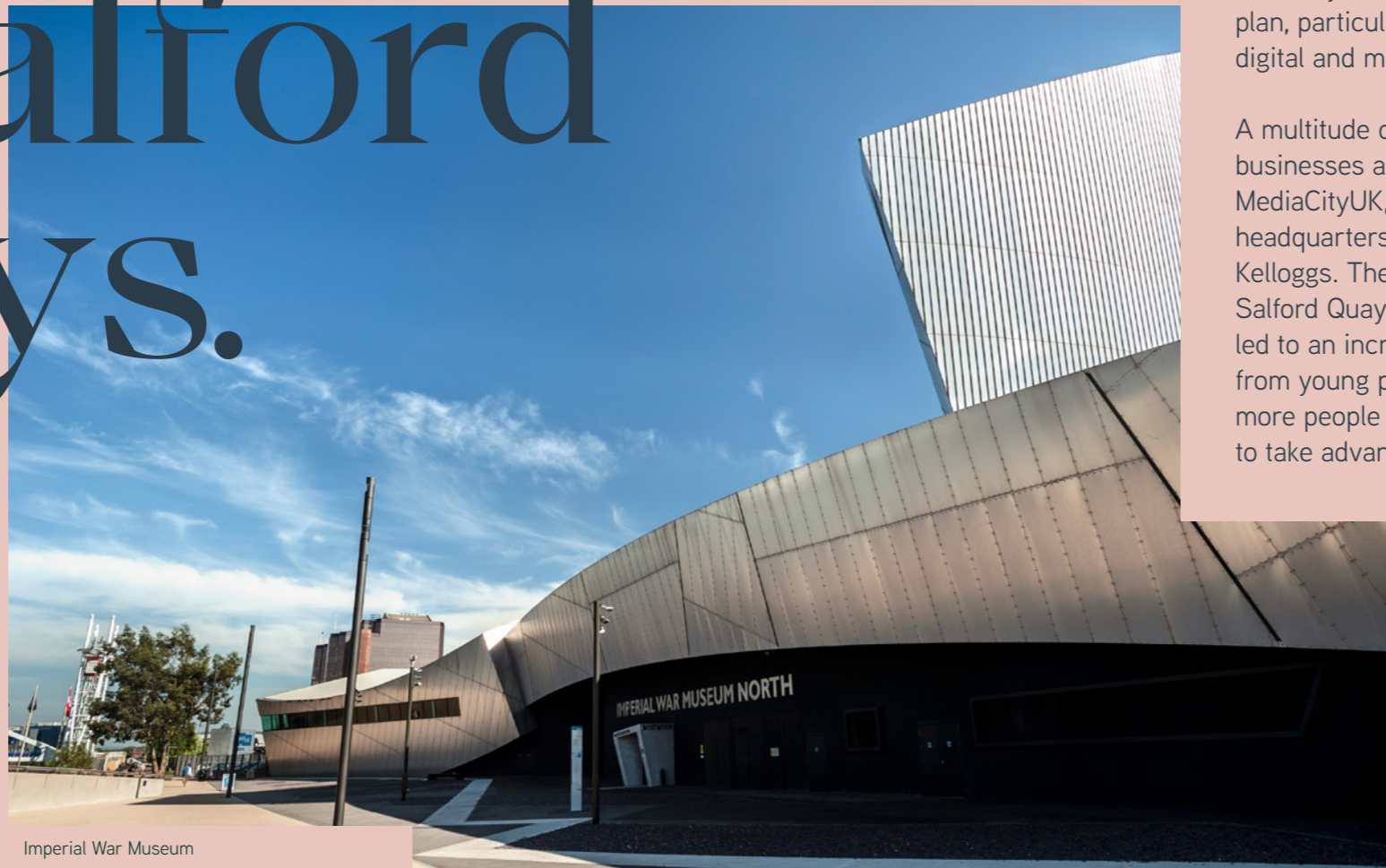
Imperial War Museum